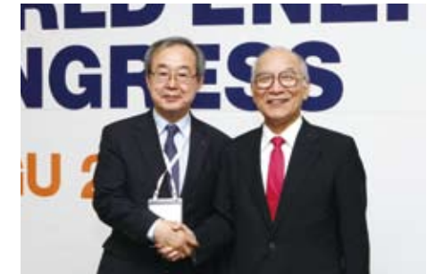
Meeting with the CEO of JAPEX

1. Meeting with 4 Officials including Vice Minister of Turkey's Ministry of Energy and Natural Resource (October 14)