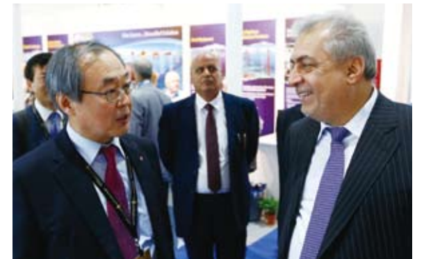
Meeting with the Iraqi Minister of Oil