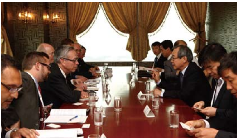
Meeting with the Canadian Minister of Natural Resources