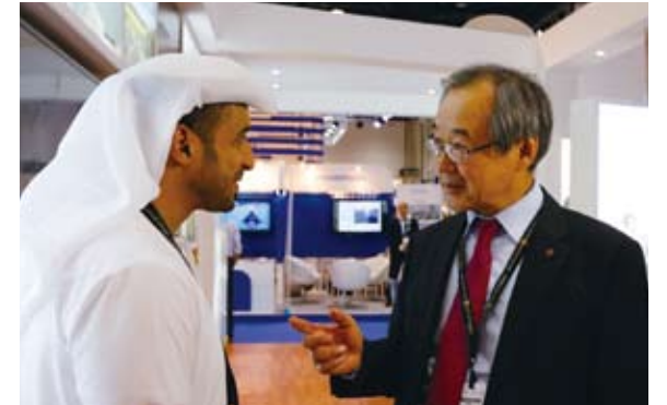
Meeting with the Director of ADNOC