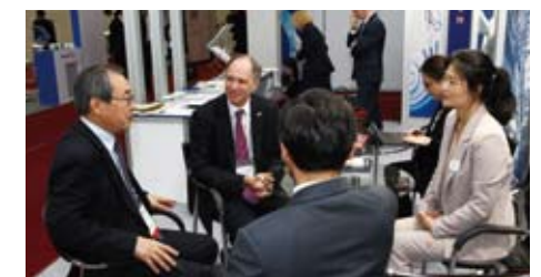
Meeting with the British Ambassador to Korea