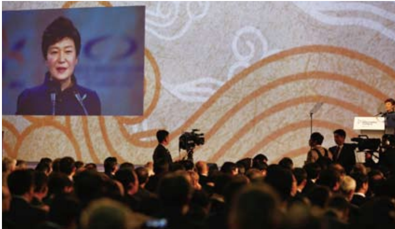
Opening session of President Geun-hye Park