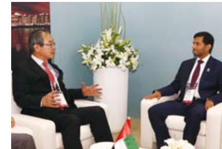
Meeting with the UAE Minister of Energy