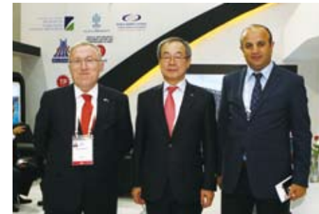
Meeting with the Turkish Deputy Minister for Energy &amp; Natural Resources